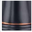
OIL RUBBED BRONZE (MNO721ORB)